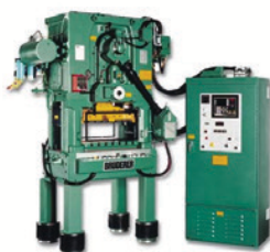
TYPICAL PUNCH PRESS

The inhalation of beryllium-containing dust, mist or fume can cause a serious lung condition in some individuals. The degree of hazard varies depending on the form of the product and how the material is processed and handled. You must read the product specific Safety Data Sheet (SDS) for additional environmental, health and safety information before working with any beryllium-containing alloys.